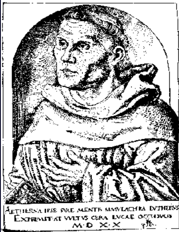
Martin Luther 1483-1546

Two views espoused during the reformation movement