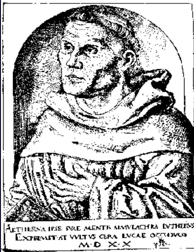
Martin Luther 1483-1546

Two views espoused during the reformation