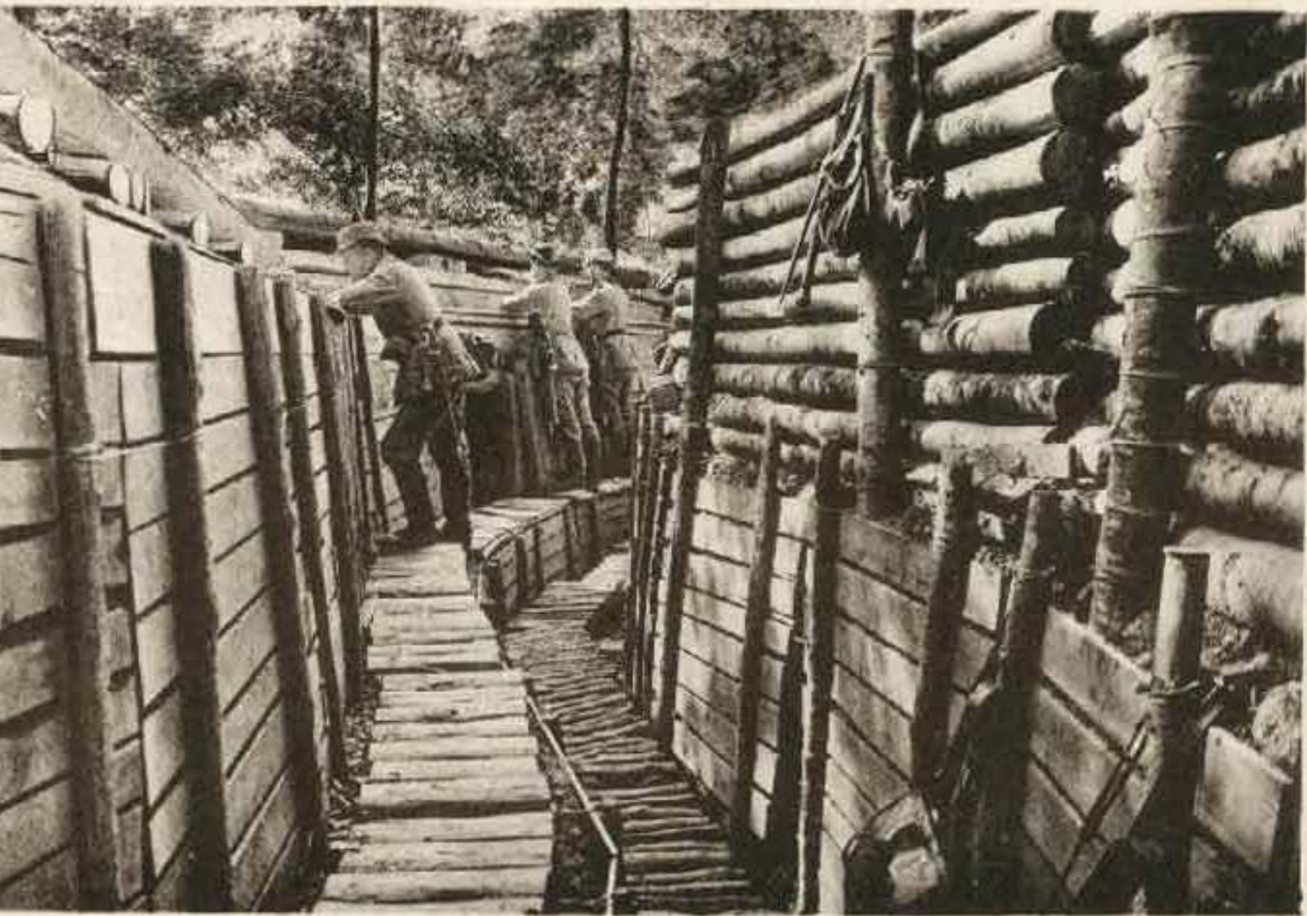
Mächtige Grabenstellung mit Auftritt