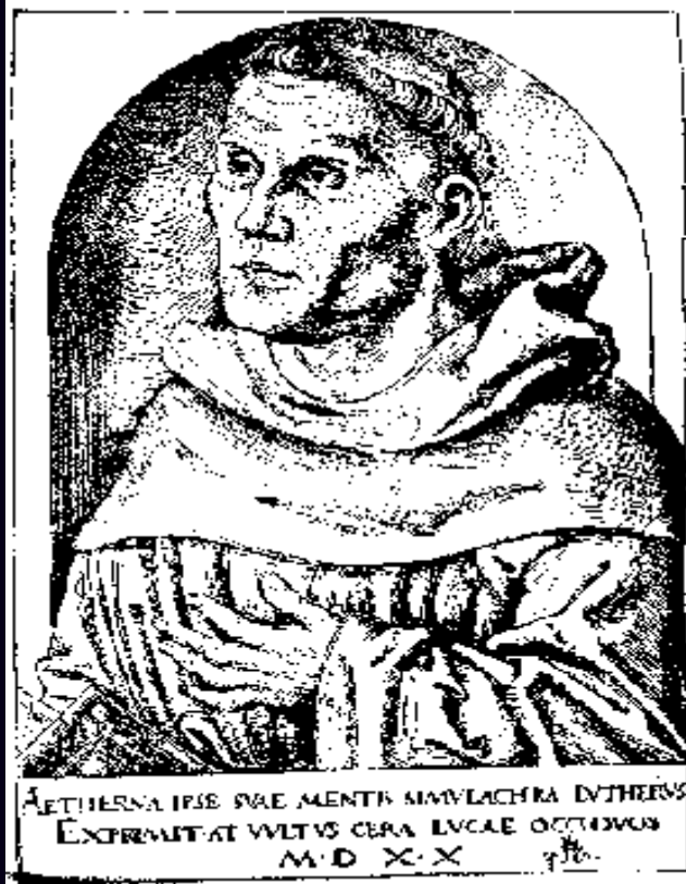
Martin Luther 1483-1546

Two views espoused during the reformation movement