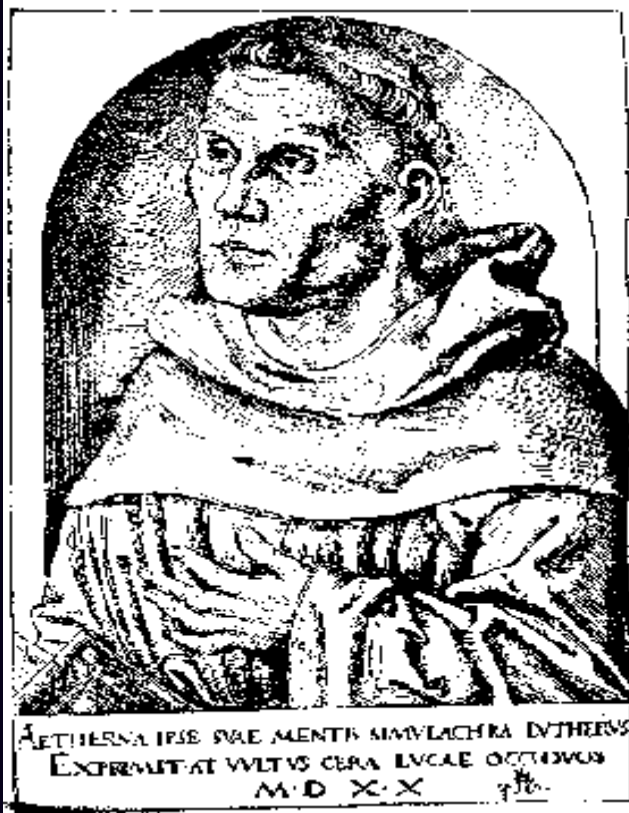
Martin Luther 1483-1546

Two views espoused during the reformation movement