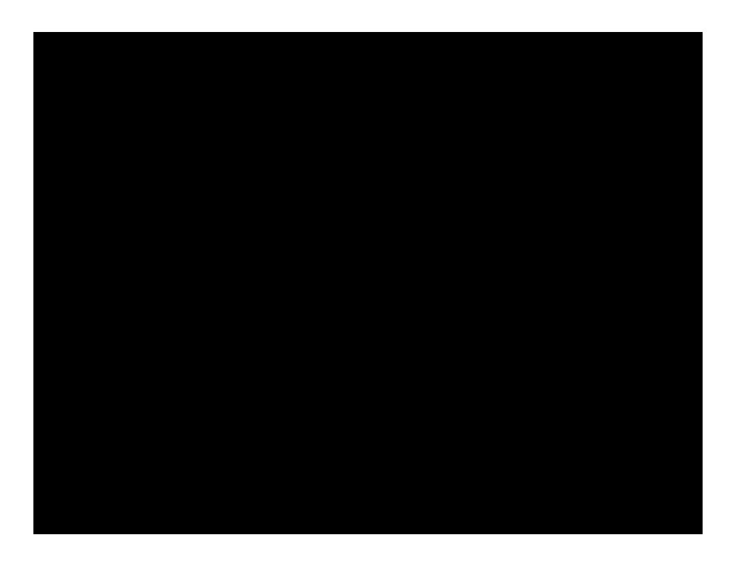
Preacher in 2008, then again 2017 We are working towards hiring a 2<sup>nd</sup> man to work (eventually replace) with me So, revised to talk about how we will pay a 2<sup>nd</sup> man --